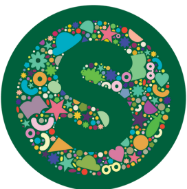
Scarcroft Green Nursery